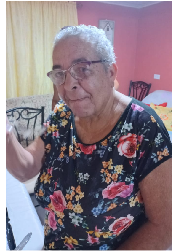
Dennie's Funeral Home Limited